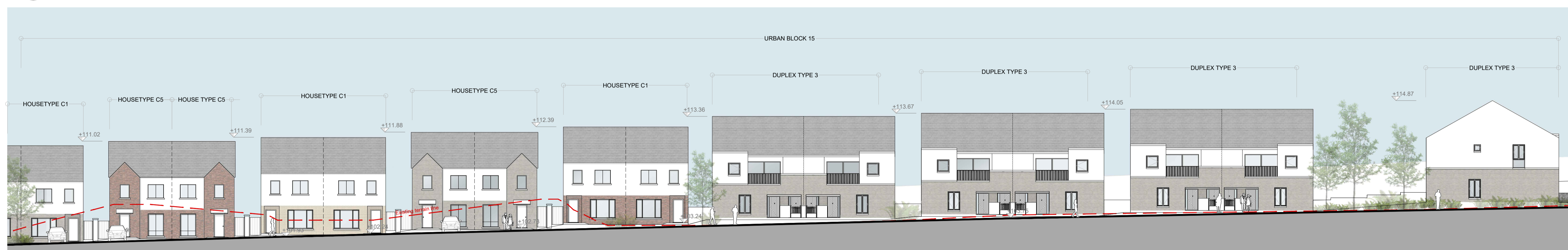
3 Proposed Site Section 4-4 2/3 1:200