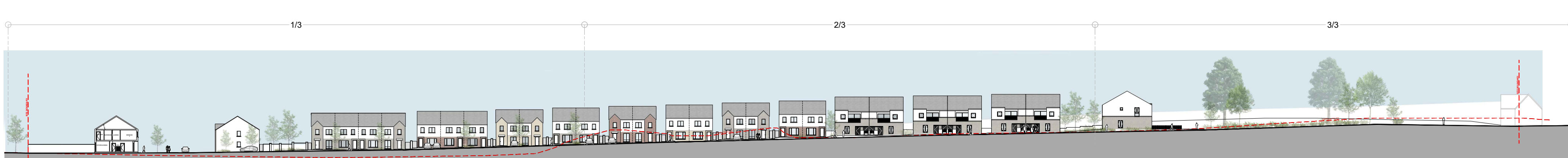
1 Proposed Site Section 4-4 1:750