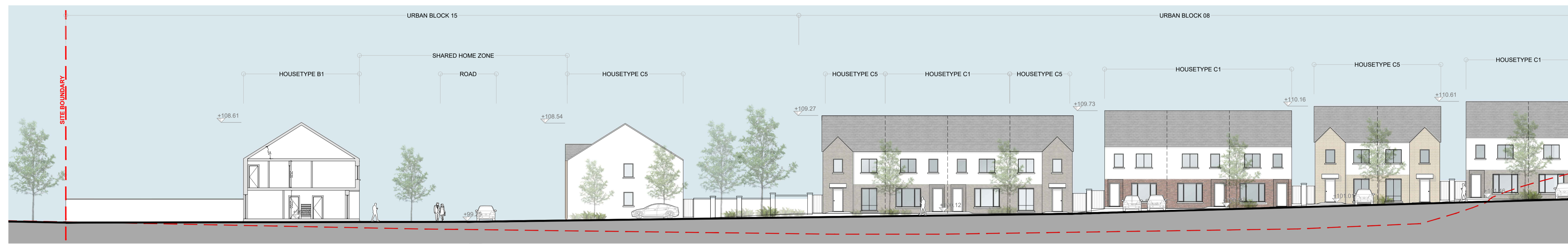
2 Proposed Site Section 4-4 1/3 1:200